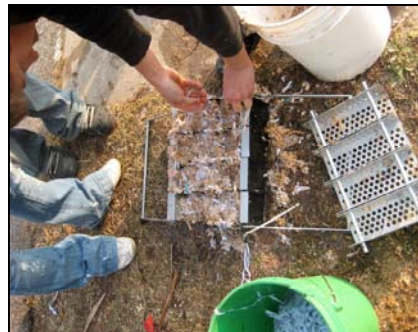
Students make fire bricks.